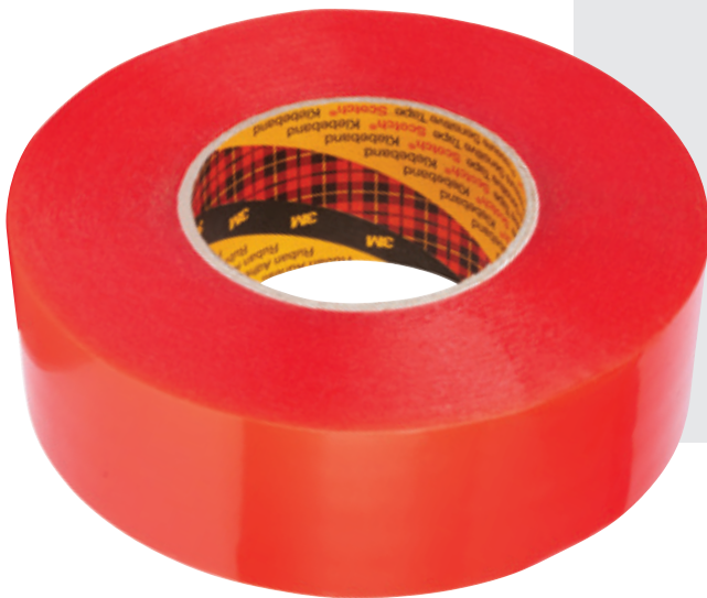
9088F200 Film liner

Value-priced, durable, general purpose tapes have a wide service temperature range from -10°F (-23°C) to 300°F (148°C) as well as: