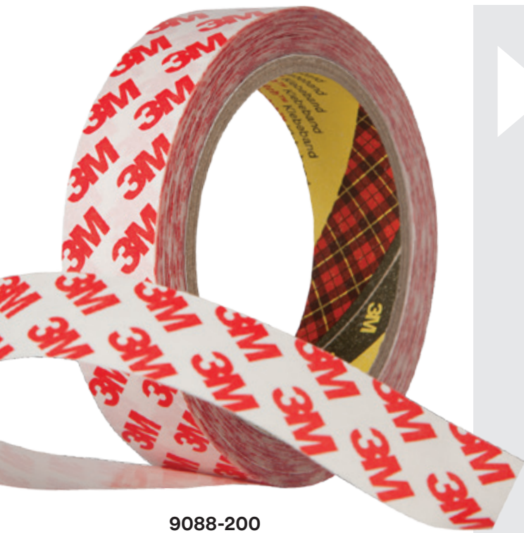
9088-200 Paper liner