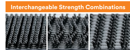
Type 400 Type 250 Type 170